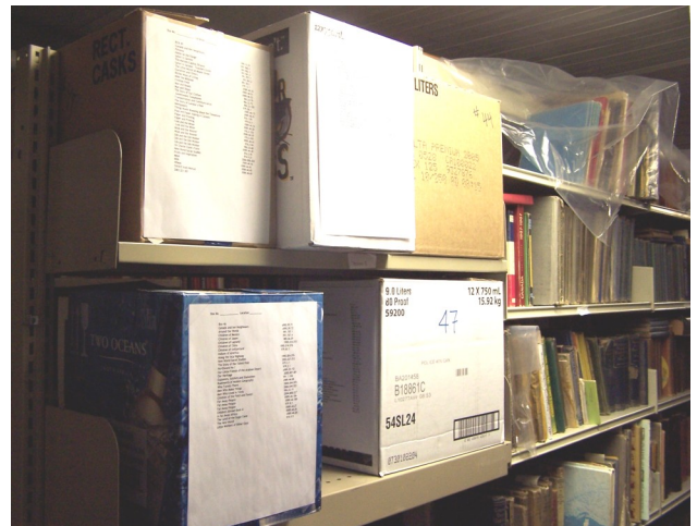
Packed boxes and books waiting to be packed.