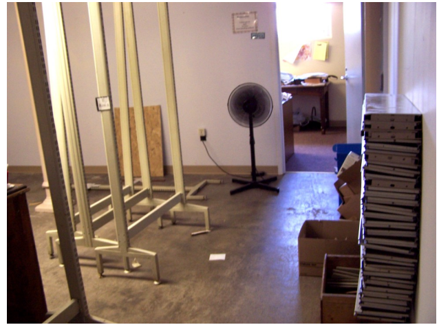
Shelf uprights and a stack of shelves on the right.