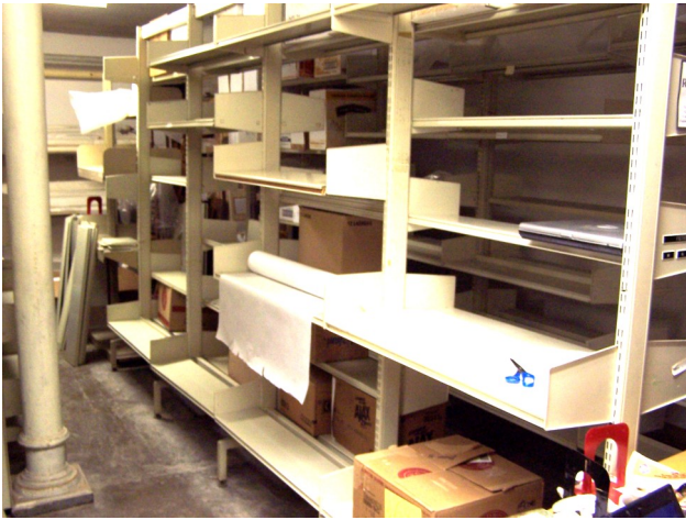
Empty shelves waiting to be taken apart.