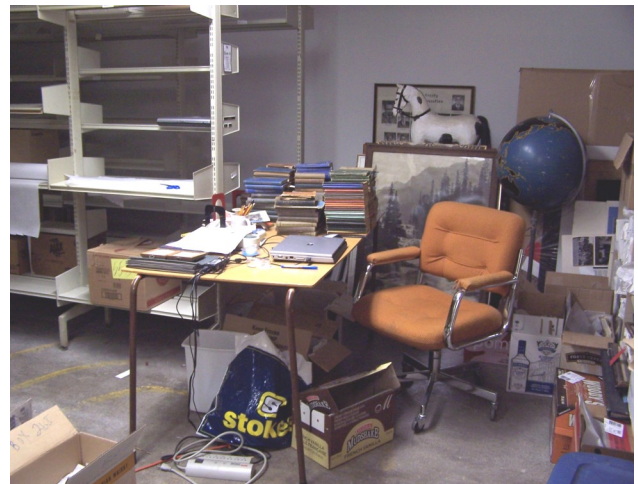
The command centre signs off.