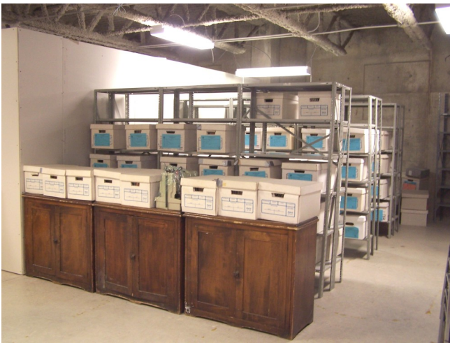
The new archives is up and running.